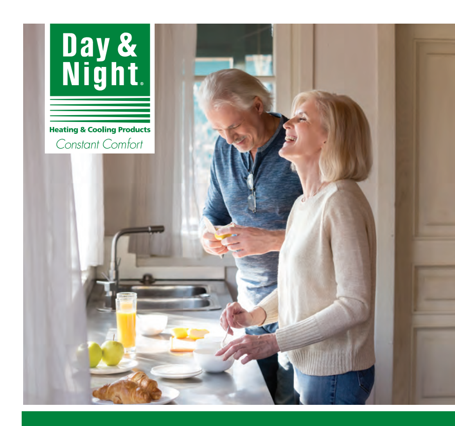
Day & Night<sup>®</sup> Split System Heat Pumps